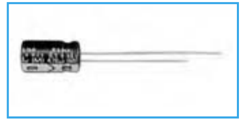
Marking color : White print on a blue sleeve